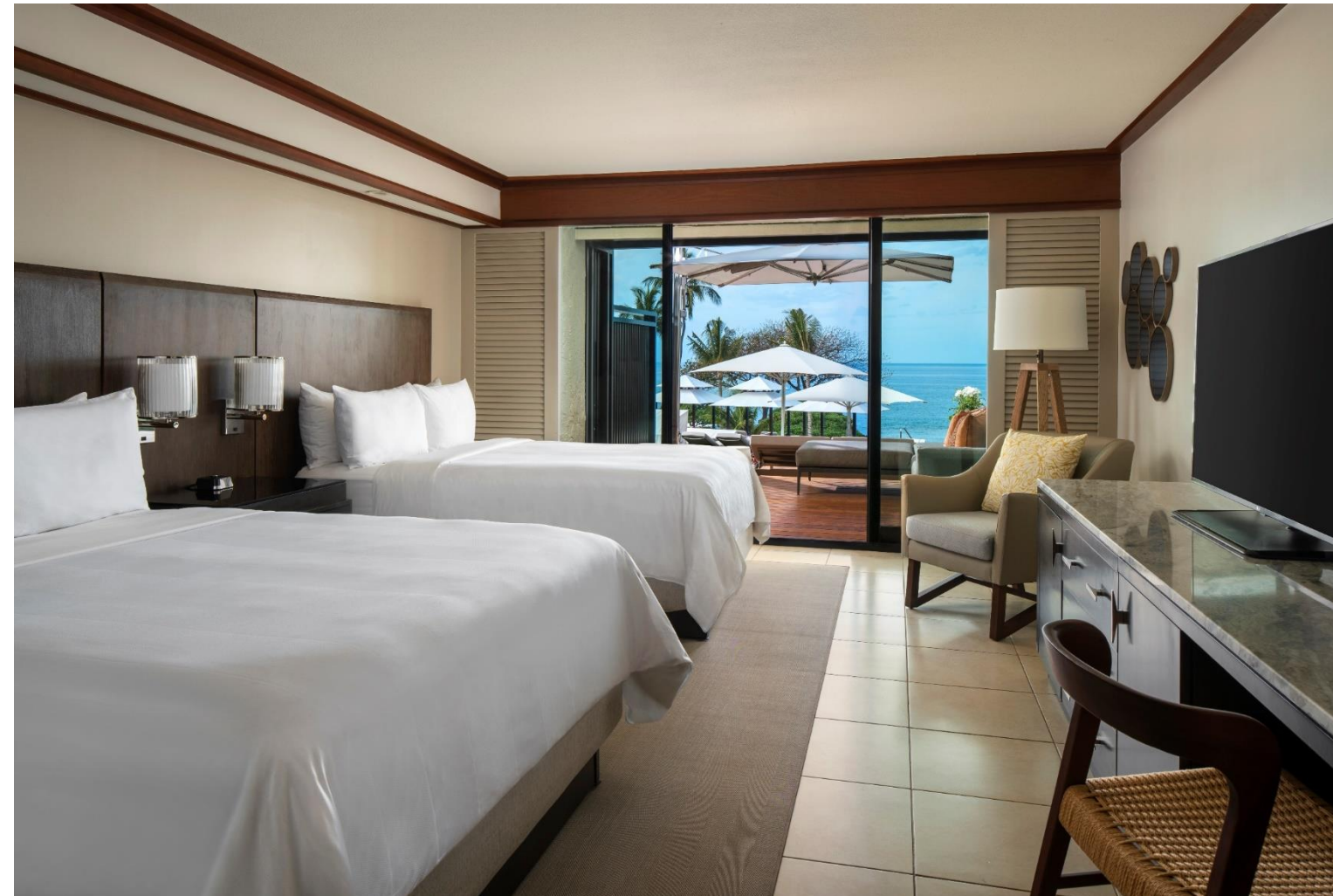
Sundeck Ocean View Rooms Spacious Wooden Decks and Outdoor Living Rooms 11 Keys | Avg 470 Sq Feet (Interior)