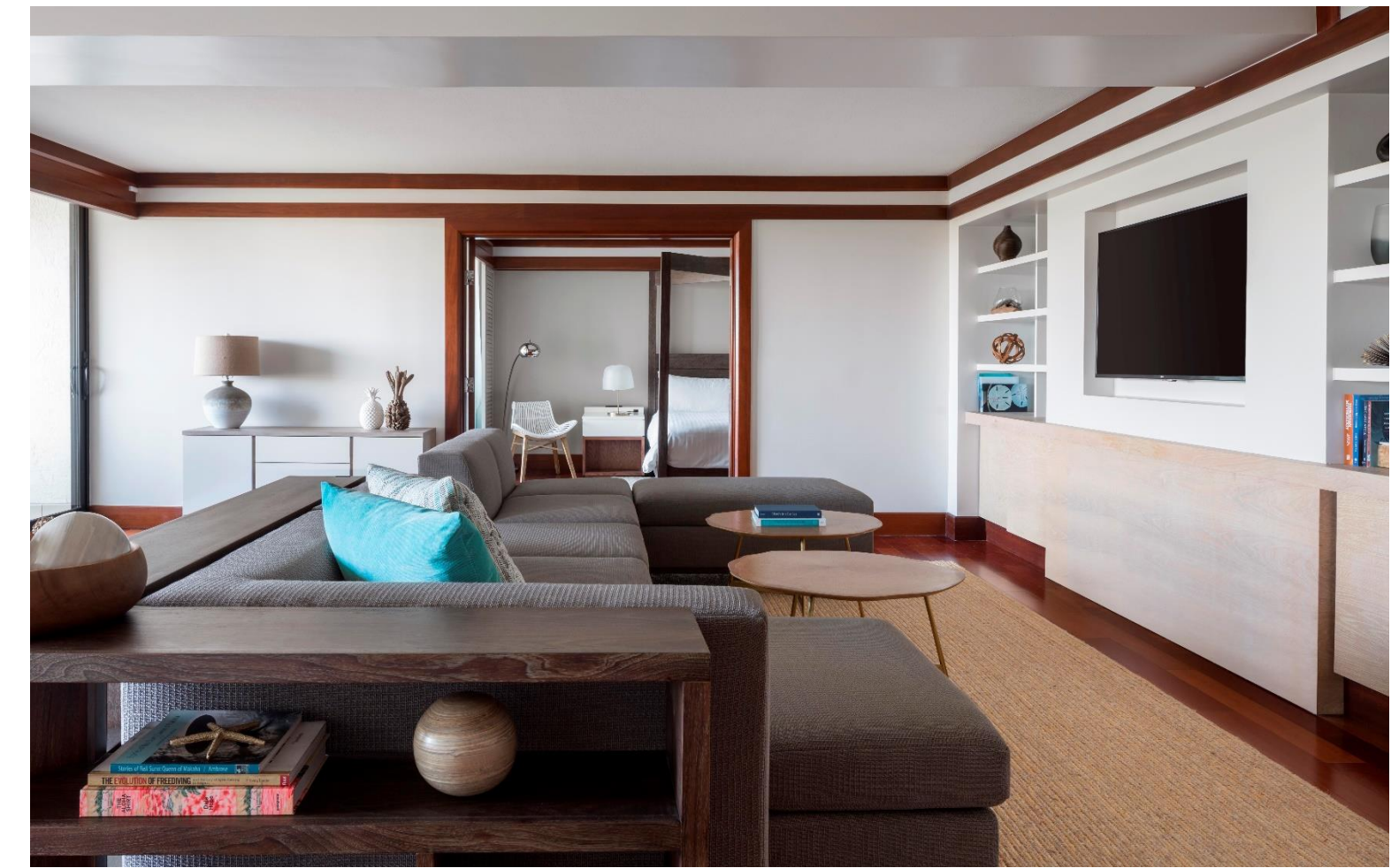
Garden and Ocean Junior Suites Spacious Seating Areas and King Beds 21 Keys | Avg 480-603 Sq Feet (Interior)