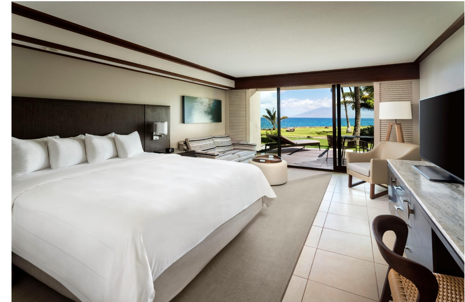
Oversized Lanai Rooms Extended Lanais (Outdoor Patios) with Garden or Ocean Views 46 Keys | Avg 470 Sq Feet (Interior)