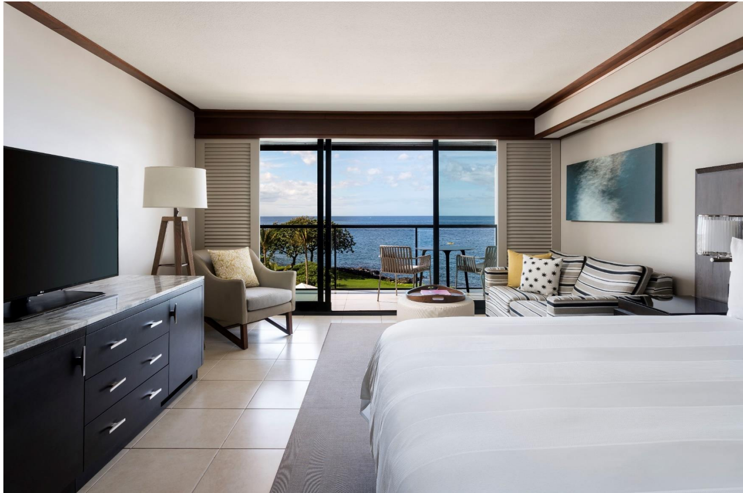
Garden and Ocean Guest Rooms Nespresso Machines and Private Lanais 436 Keys | Avg 470 Sq Feet